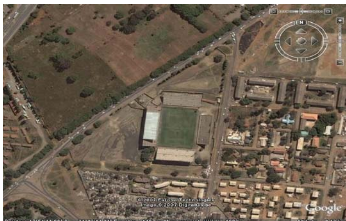
Rufaro Stadium in Harare

Further information on Win in Africa with Africa: http://www.fifa.com/mm/goalprojectWinAF_E.pdf