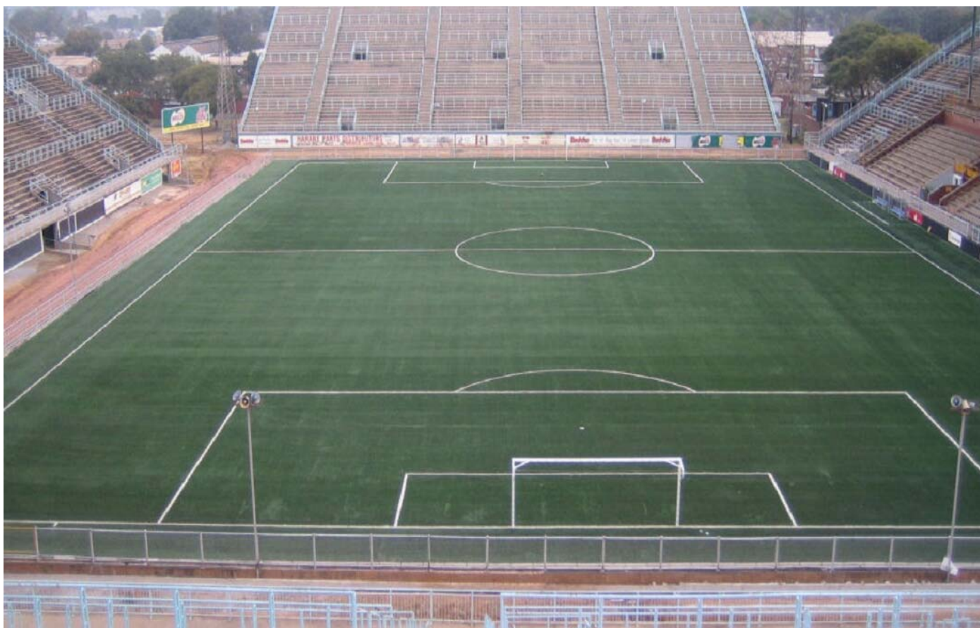
Before the re-opening of the Rufaro stadium, where football will be played on an approved artificial turf pitch.