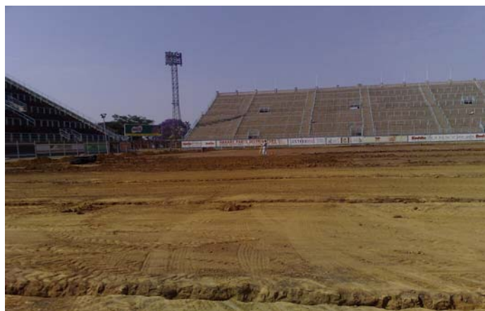
The pitch required a lot of work.